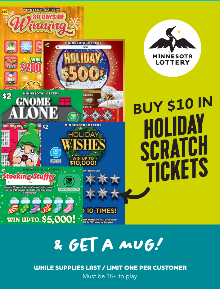
Retailer Sales Incentive Example.