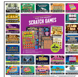
Counter Scratch Display Sticker

Replace the Counter Scratch Display Sticker.