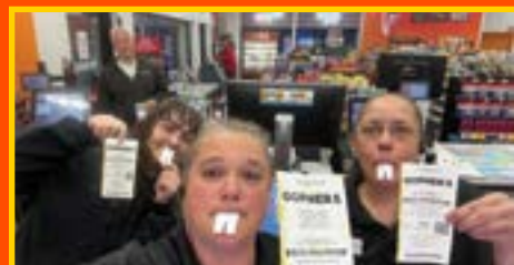
Season Market Holiday, Woodbury