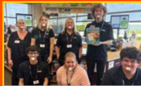
Coborns, Bell Plaine