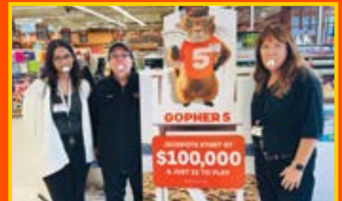
County Market, Andover