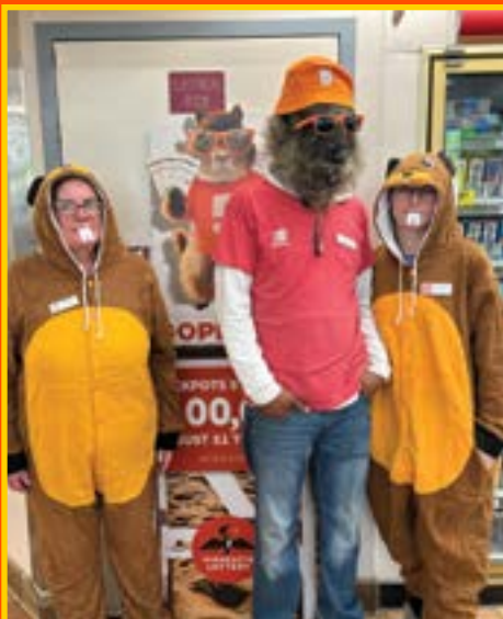
Speedway, Falcon Heights

Thanks to everyone who came out of their burrows and made the Gopher 5 retailer incentive a "hole" lot of fun! Your photos proved that when Gopher 5 shows up, fun is always close behind. Check out some of our favorites!