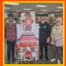
Trails Edge, Pierz