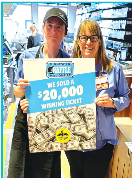
Kwik Trip #111, Oak Park Heights

We welcomed the new year by announcing the winning numbers for the highly awaited Minnesota Millionaire Raffle. On New Year's Day, 20,000 winning numbers were announced, and news quickly spread about where the top prize-winning tickets were sold. Below are some pictures of our retailers receiving their bonus checks for selling some of the top Raffle prizes.