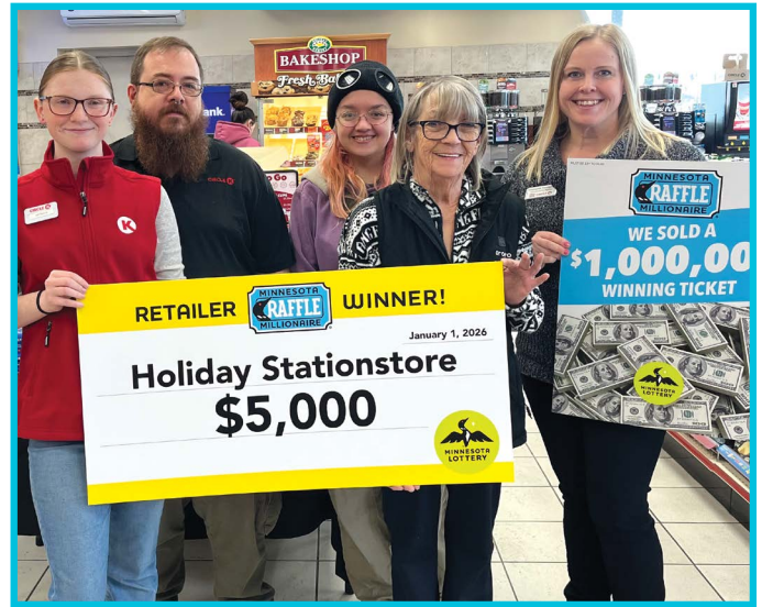
Holiday #27465, Coon Rapids