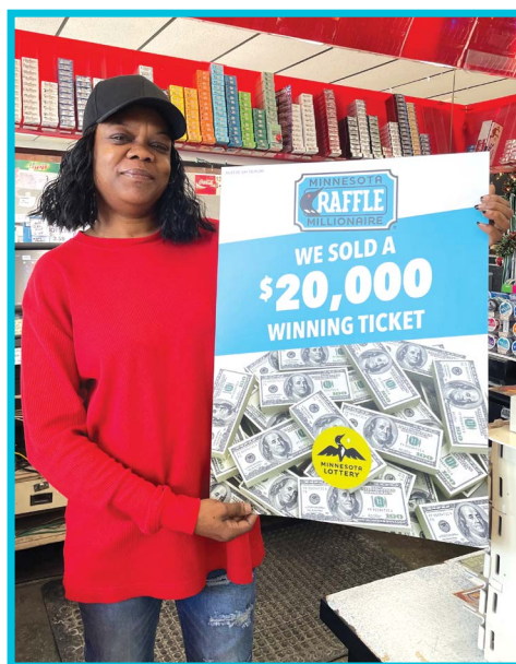
Dayton Gas Stop, Dayton