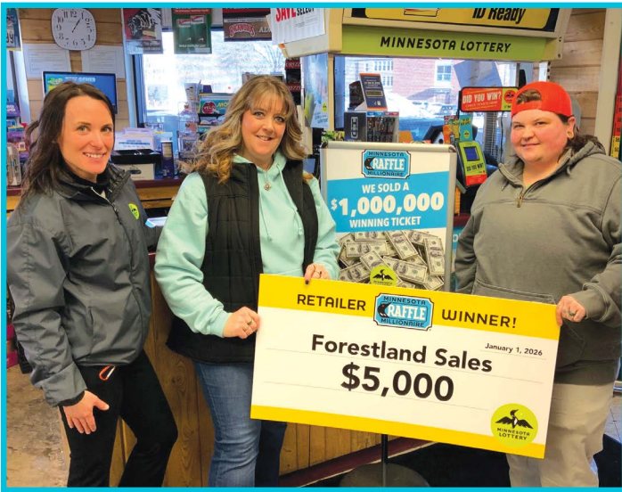
Forestland Sales, International Falls