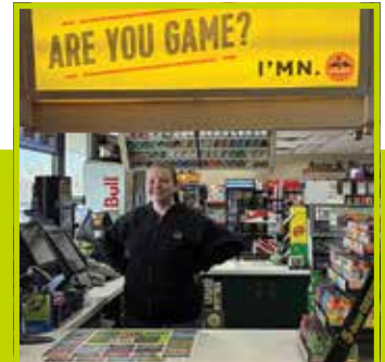
New Mart / Eagan