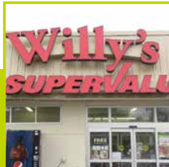
Willy's SuperValu / Wheaton