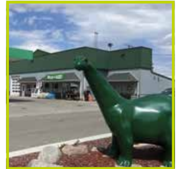
Gappa Oil / Parkers Prairie