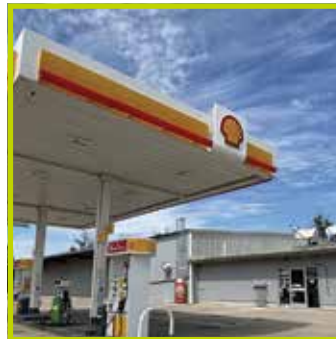
By-Lo Gas and Grocery / Hancock