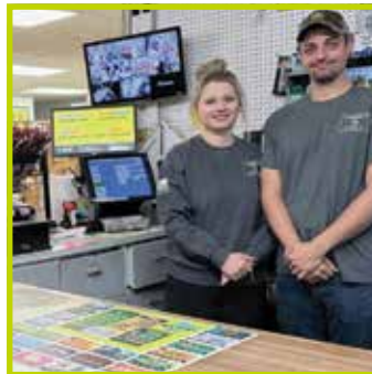
Pritchard's Corner / Big Falls