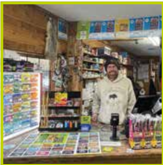
Mississippi Landing / Jacobson

Mom & Pop Business Owners Day was March 29th and to celebrate, we want to highlight some local retailers across the state who bring convenience, connection, and a little fun to their neighborhoods every day. Thanks for bringing the fun to every corner of Minnesota!