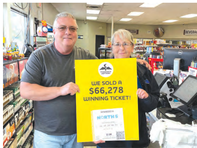
Northdale Oil, Bemidji