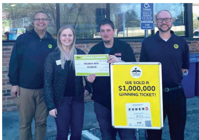
Holiday Stationstore, Minnetonka

"The Minnesota Lottery's commitment to retailers supports members of the Minnesota Service Station & Convenience Store Association (MSSA) and sets them up for success — now and for years to come. Through our partnership with the Lottery, we are able to support retailers not only economically but also in navigating regulatory compliance and ensuring a thriving business environment. The continued support from the Lottery strengthens local businesses, fosters growth, and reinforces the important role convenience stores and service stations play in communities across Minnesota."