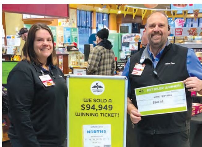
Kwik Trip, Lake City