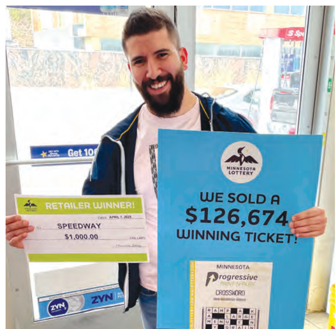
Speedway, South St. Paul