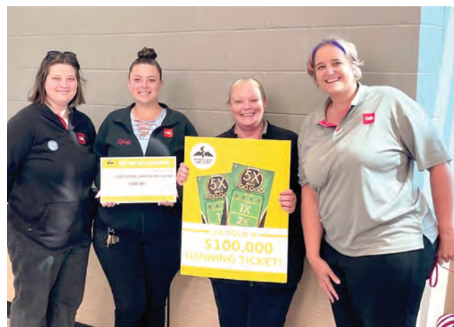
Cub Foods, Arden Hills