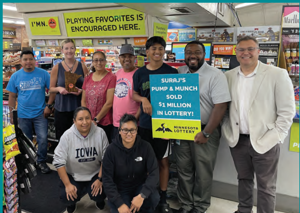
Suraj's Pump & Munch in Austin joined the Million Dollar Sales Club in FY25.

FY25 MILLION DOLLAR SALES CLUB: 19 retailers