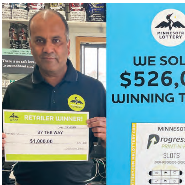
By The Way, Waseca

The Lottery is proud to partner with approximately 3,000 retailers across the state in all of Minnesota's 87 counties. We coordinate with our retail partners and state retail associations and provide them with the support they need to successfully promote and sell lottery products, while also equipping them with responsible gambling resources. Retailers benefit by attracting customers and earning commissions - boosting their businesses in the process. It's a win-win for everyone.